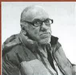
Reaching Out on Behalf of Those Who Need Rescue Pg. 2