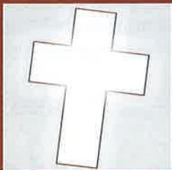
The Life-Changer's Club Pg. 2