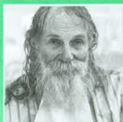
Thank you for supporting Chattanooga Rescue Mission . . .