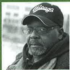
I'll Be Home for Christmas Pg. 2