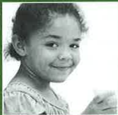
Share Christ's Love with the Homeless Pg. 2