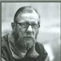
God bless you for being a friend to homeless people . . .