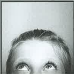
Can You Imagine?