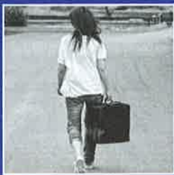
"I'm Tired of Running"