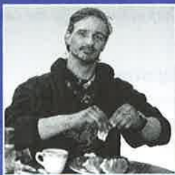
Windows and Mirrors . . .