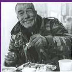
Thank You for Helping Us Share the Message Pg. 2