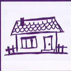
If I Can Just Make It Home Pg. 2